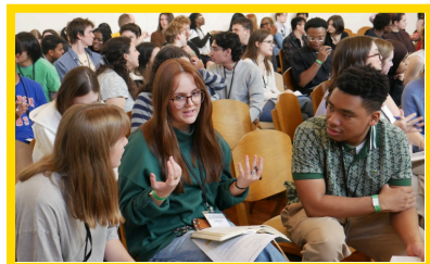
Images: Students in January 2026 planning to organize their campuses for May Day 2026.